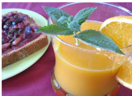
Mint (in smoothie)