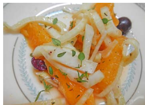
Thyme (individual tiny leaves)