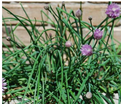
Many herbs, such as chives, can easily be grown in a container or garden.

Experience what a difference in appearance and flavor fresh herbs can make. Better yet ... they do this without adding extra calories! For example, top a baked potato with a dollop of yogurt and a sprinkling of chives or parsley.