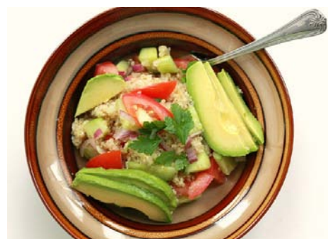
Parsley (leaves of flat-leafed parsley)