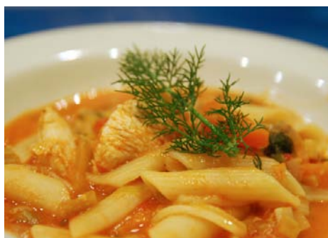
Dill (small, tender sprig)