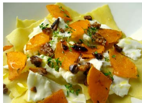
Thyme (young thyme with tender, edible stems)