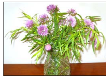
If you have extra herbs, enjoy herbal bouquets.

A general guideline when using fresh herbs in a recipe is to use 3 times as much as you would use of a dried herb. When substituting, you'll often be more successful substituting fresh herbs for dried herbs, rather than the other way around. For example, think potato salad with fresh versus dried parsley!