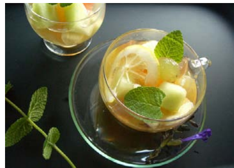
Mint (with fruit)